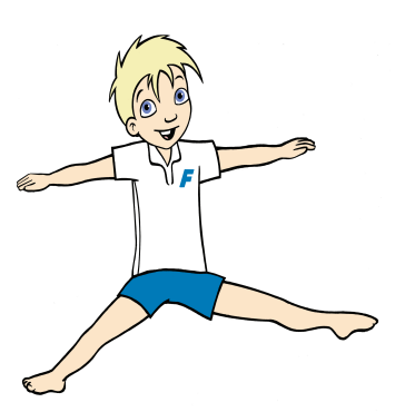
Child moves slowly into their favourite shape